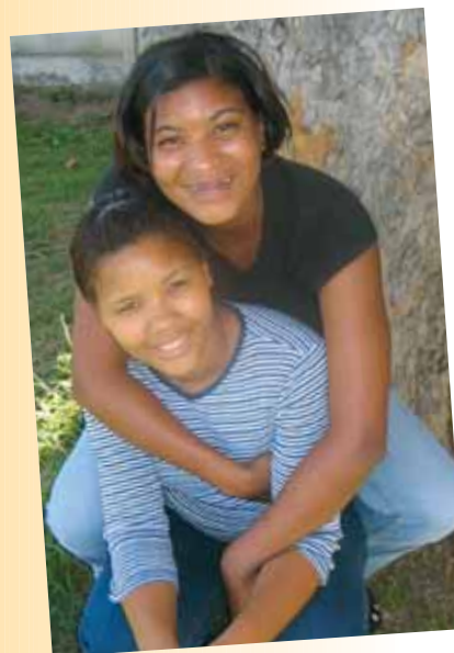
Friends help make everything better ...