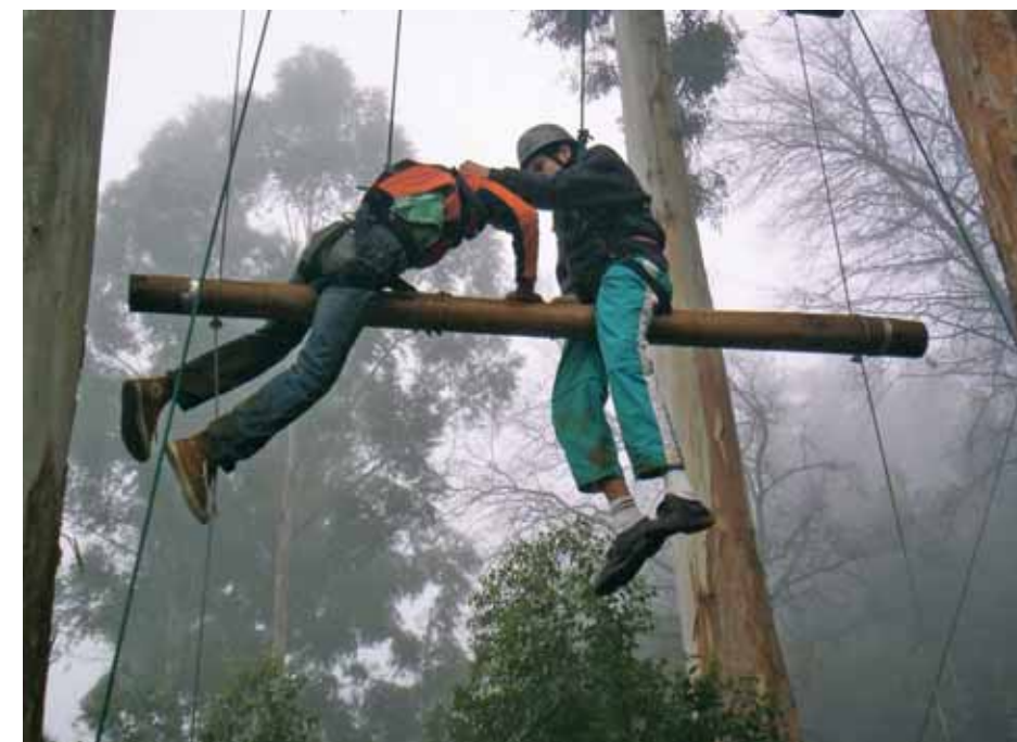
Having someone to count on makes all the difference ... children from our Macassar Family Home learn about teamwork – and trust.