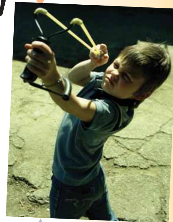
While youngsters come to us for many reasons, the root cause is most often that they have not been taught the social skills needed to manage life's situations.

Why not come and see this for yourself? To arrange a visit in your region, please call us on (011) 482 2655.