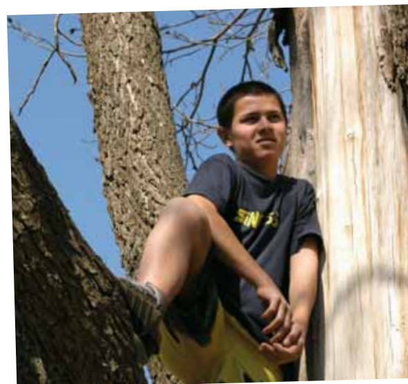
A Chinese proverb: Tell me, I'll forget. Show me, I may remember. But involve me and I'll understand.