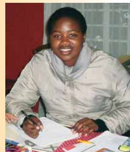
At work on ... homework.