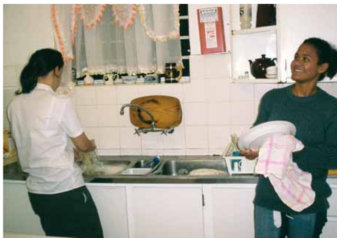
Chores are part of daily life at Girls & Boys Town. Boys take turns to serve food (left) and (above) girls at our Alpha Family Home wash and dry dishes as part of their duties.