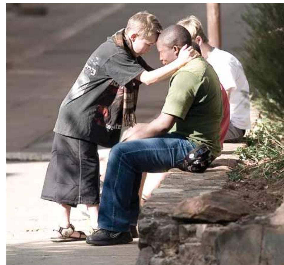
Everyone needs a big buddy to lean on sometimes ...