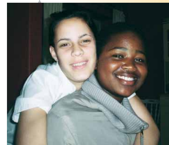
Friends sharing a special moment.