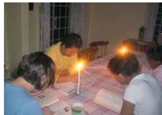
Thanks to your generosity, power cuts will no longer disrupt important routines at Girls and Boys Town. What a relief!

We've heard that load-shedding will be reintroduced in 2009 - so your generosity really has helped us to be prepared. Thanks again!