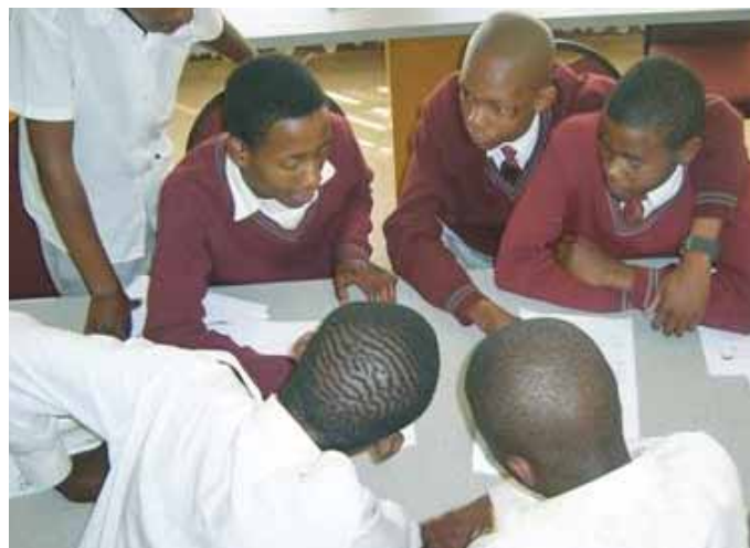
Learners focus on their work at our Protem unit.

'I'm going to do the right things because I now know the skills ... if you follow the skills that they taught us you will make your dreams come true. Thanks for teaching us all the good things that we must know when we go back to school, to be the best