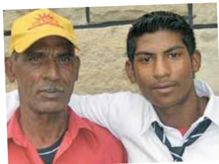
Father and son ... together again.