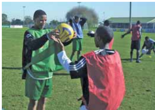
Regular training sessions are enjoyed by our young soccer stars.