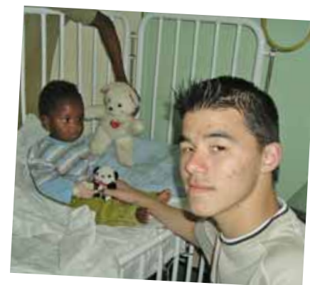
Community spirit in abundance ... youth are encouraged to get involved in voluntary work whenever possible. Here, one of our boys hands a toy to a baby in hospital.