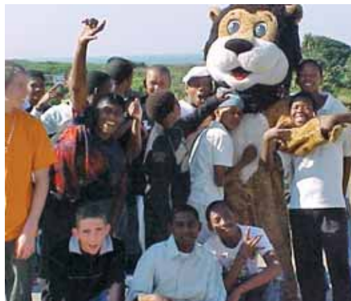
Thanks to a visit from the Simba lion, a roaring good time was had by everyone at Girls & Boys Town Tongaat.