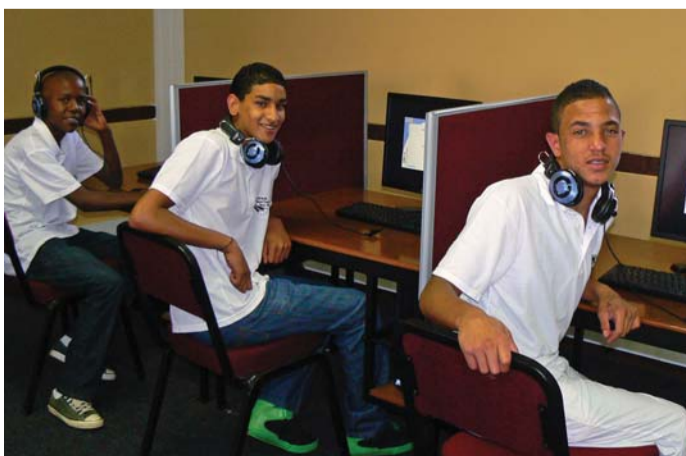
The boys try out the new computers at the centre.

A grade 9 youth, Girls and Boys Town, Kagiso, October 2010.