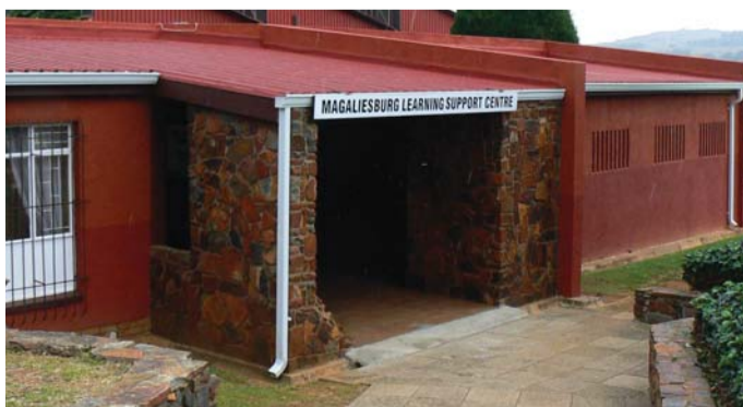
The new centre will provide our young people with the skills they need for school – and for their future careers.